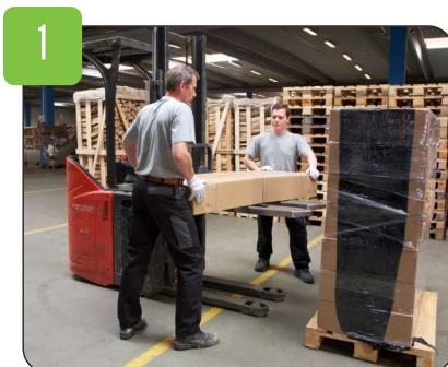
Stand close to the box with slightly bent knees and hips.