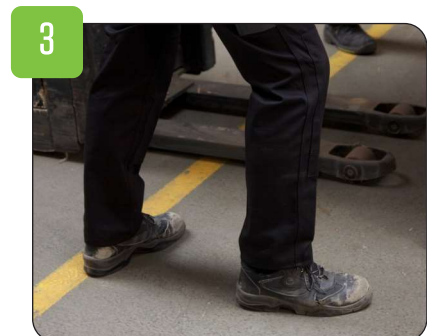
When pushing, stand sideways with slightly bent knees and one foot slightly in front of the other.