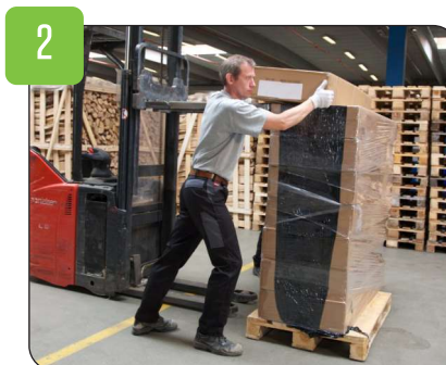
Keep your back straight and shift your weight from the foot behind to the foot in front.