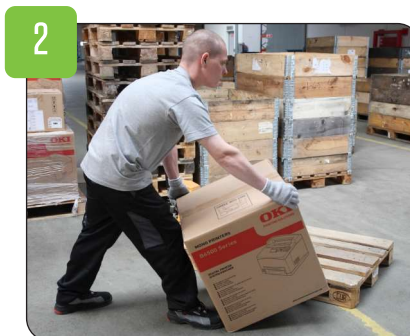
Make sure you have plenty of space. If you need to twist the box to the left – put your right foot in front.