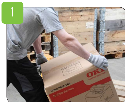
Get a good hold.