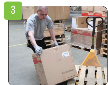
Tip the box onto the edge and twist it in over the pallet – and let the box rest on it.