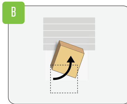
Twist the box in over the edge of the pallet.